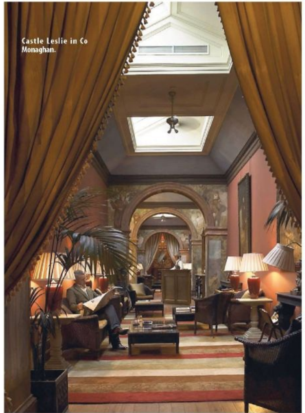
Castle Leslie in Co Monaghan.