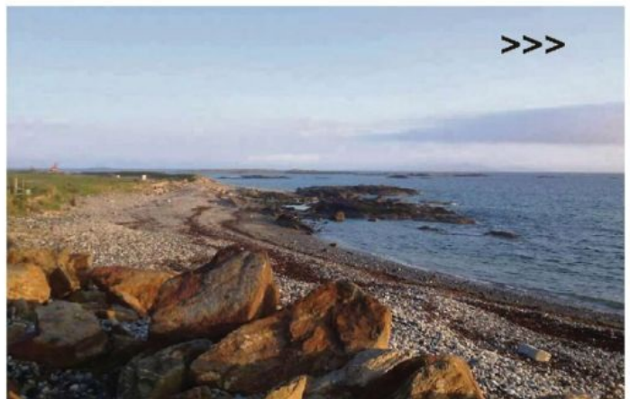
Left: Roundwood House in Co Laois. Right: Renvyle Beach by Renvyle House Hotel and Resort.