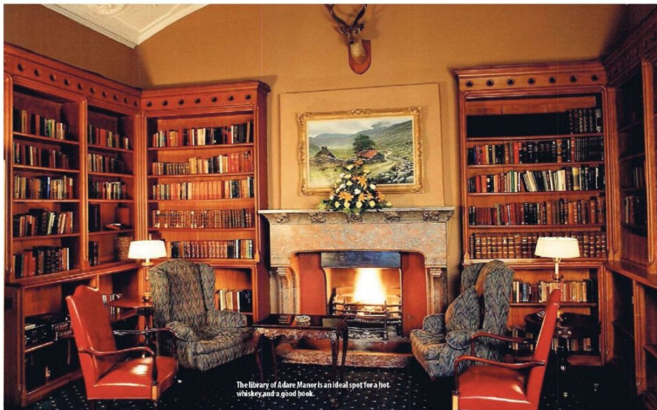
The library of Adare Manor is an ideal spot for a hot whiskey and a good book.

are just the ticket after a bracing walk. Where: Gougane Barra Hotel, Macroom, Cork; gouganebarra.com What: Autumn offers include 2 nights B&B+1D from €210pp.