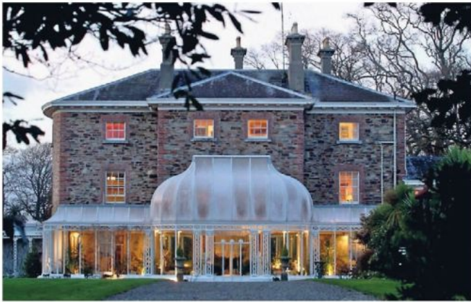
Above: Stunning Marfield House in Wexford. Below: The Manor House at Mount Juliet Estate in Kilkenny.